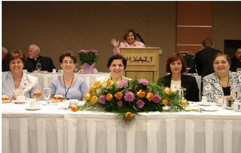
Outgoing Officers of the North American Board of the Antiochian Women 2003 - 2005

had challenged us with a $500,000.00 goal over a period of five years. We had a good start raising $115,000 in our first year thanks to everyone's hard work. This amount includes $1000.00 which was a gift to the Metropolitan from the Antiochian Women on the occasion of his 40th anniversary in the episcopacy and